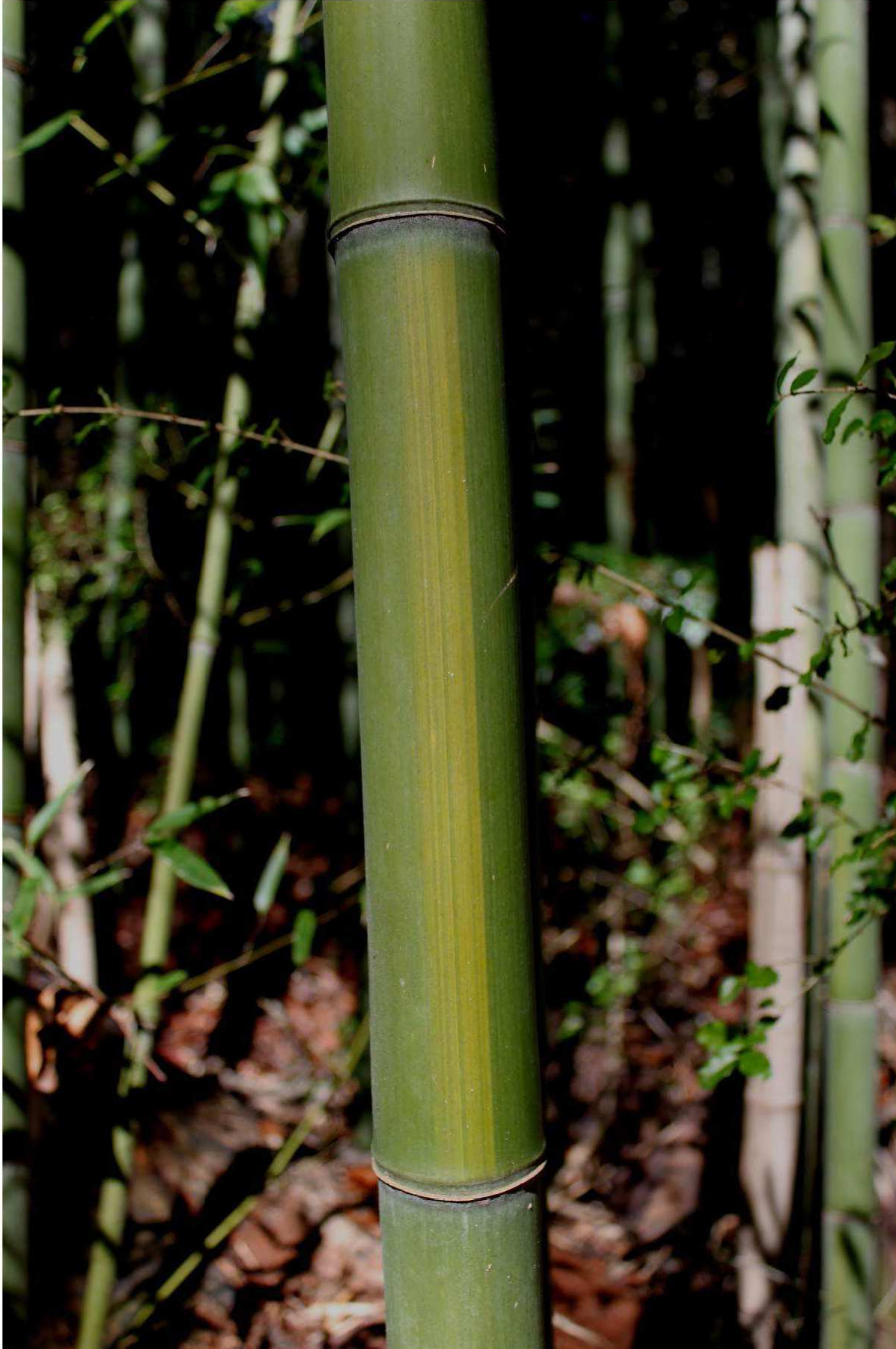
Figure 6. Phyllostachys aureosulcata (Poaceae).